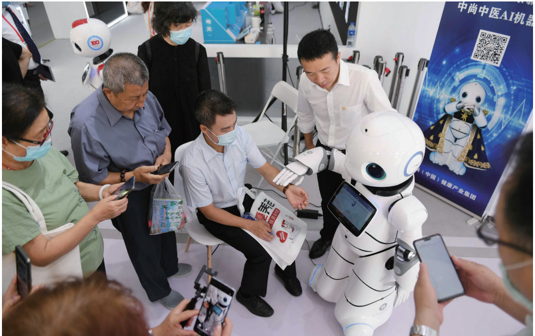
A Chinese traditional medicine robot pulse a patient at China International Fair for Trade in Services on September 7. It can interact with people through TCM diagnosis, and provides services such as physical examination and health consultation (XINHUA)