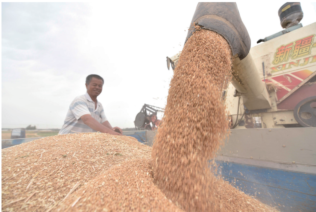
A farmer loads harvested wheat onto a truck in Xinghuliu, a village in Liaocheng, Shandong Province in east China, on June 15