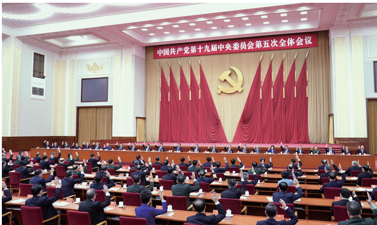
The Political Bureau of the Communist Party of China (CPC) Central Committee presides over the Fifth Plenary Session of the 19th CPC Central Committee. The session was held in Beijing from October 26 to 29 (XINHUA)