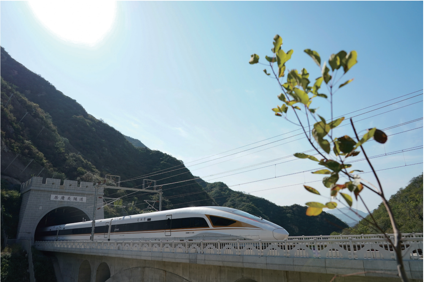
A bullet train runs through the Juyongguan Tunnel of the Beijing-Zhangjiakou High-Speed Railway in Beijing on October 6 (XINHUA)