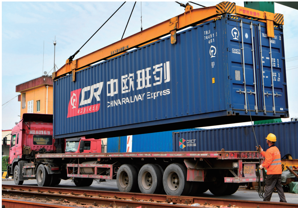
A container is loaded onto a China-Europe freight train at the Haicang Station in Xiamen, Fujian Province in southeast China, on April 25