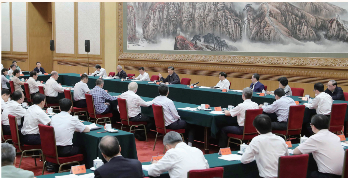
Xi Jinping presides over and delivers a speech at a symposium held on September 11 by the CPC Central Committee to heed opinions from scientists