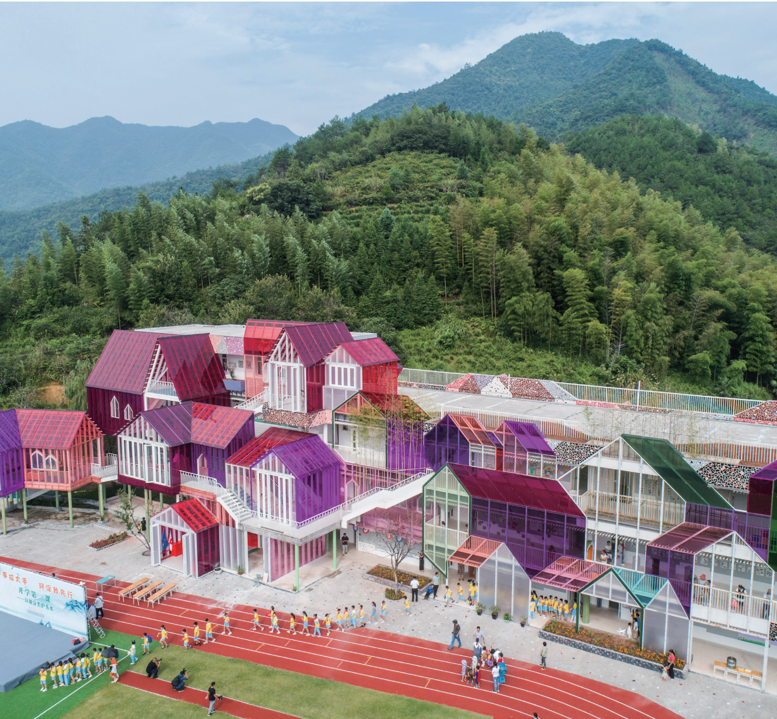
Aerial photo taken on August 31, 2019 shows Central Primary School of Fuwen Township at Fuwen Village of Chun'an County in Hangzhou, Zhejiang Province in east China