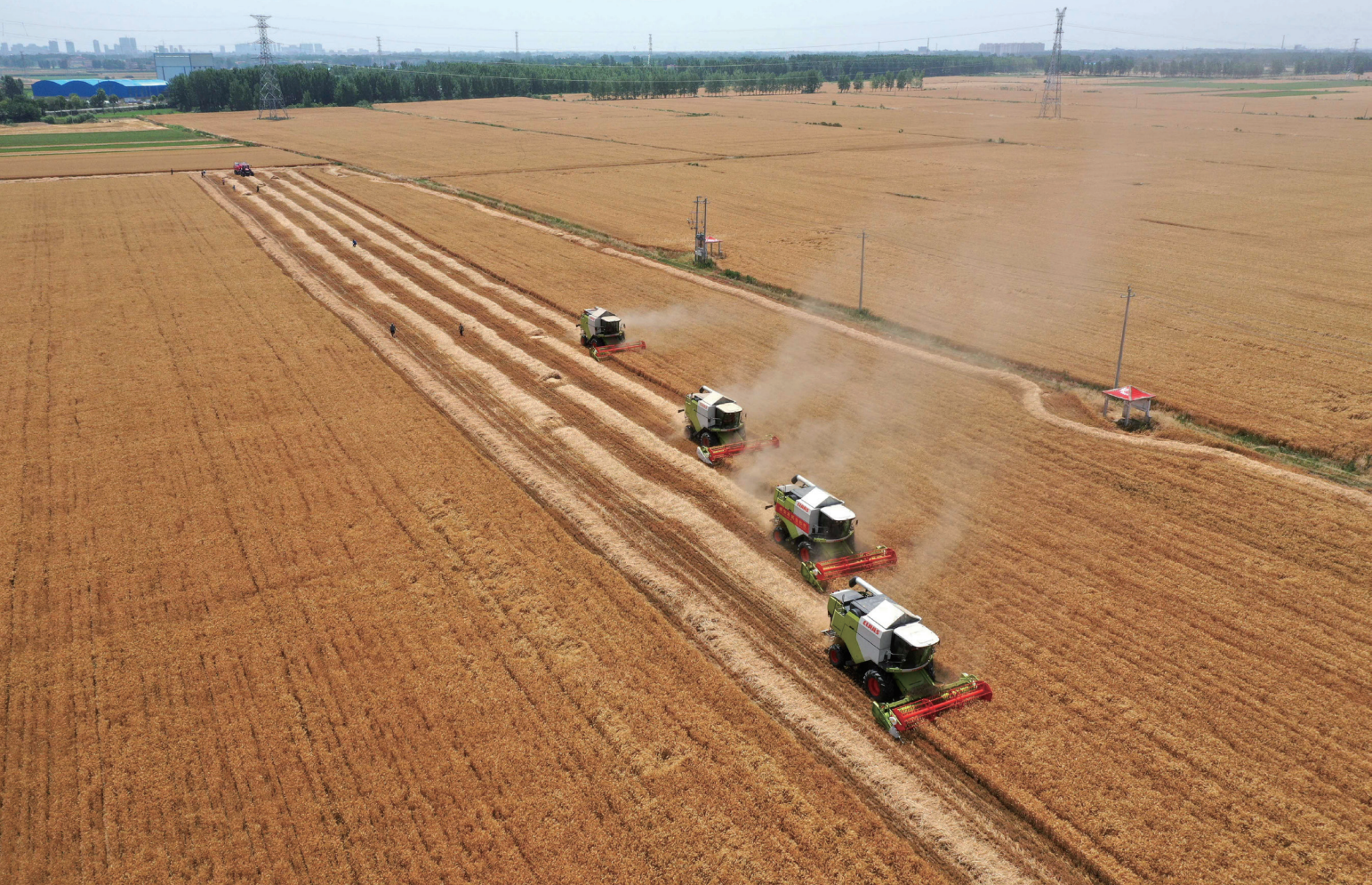
Harvesters at work in a wheat field in a village in Dengzhou, Henan Province in central China, on May 26