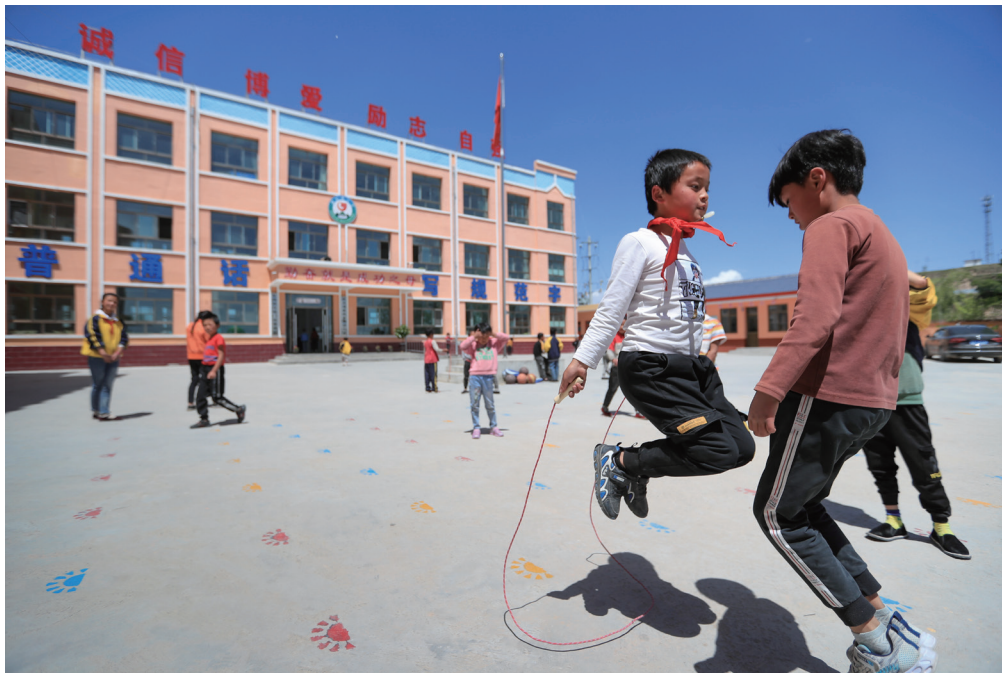
Students play at a primary school in Dongxiang Autonomous County, Linxia Hui Autonomous Prefecture, Gansu Province in northwest China, on May 29