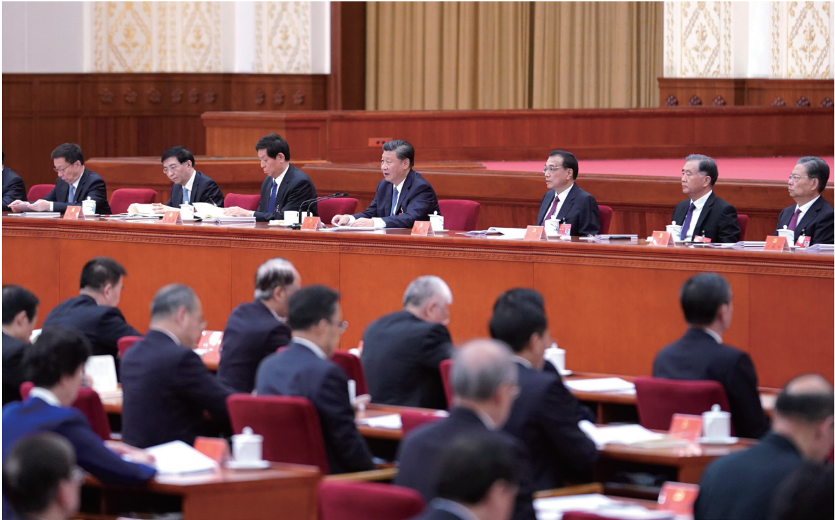
Xi Jinping, Li Keqiang, Li Zhanshu, Wang Yang, Wang Huning, Zhao Leji and Han Zheng attend the Fifth Plenary Session of the 19th Central Committee of the Communist Party of China in Beijing, capital of China

economic and social development targets for the next five years.