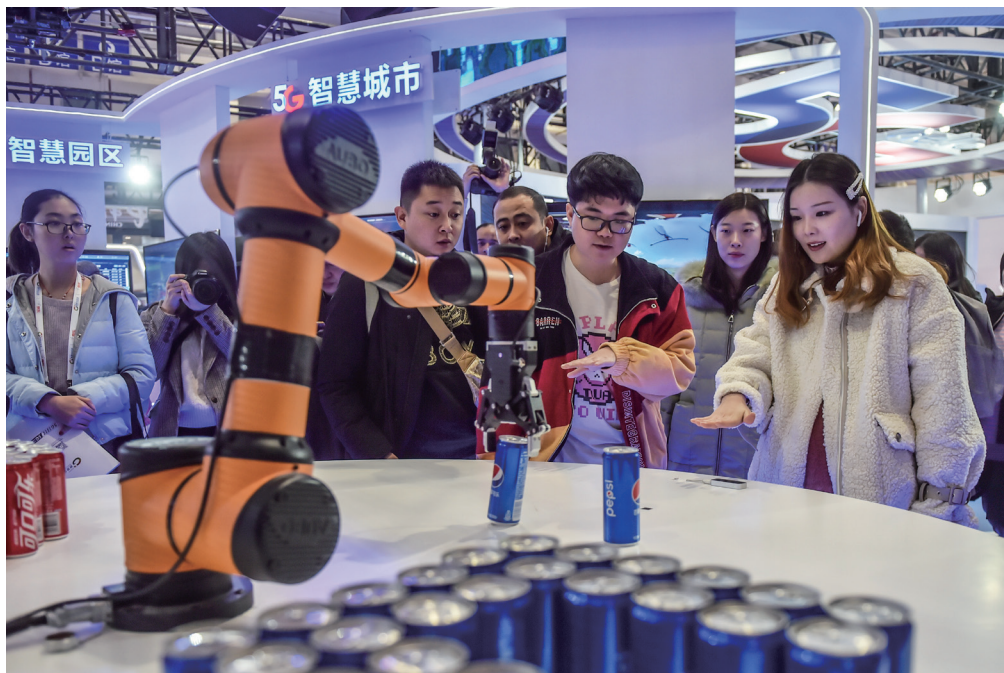
A robot grabs a drink for visitors at the 2019 World 5G Conference held in Beijing, on November 21, 2019