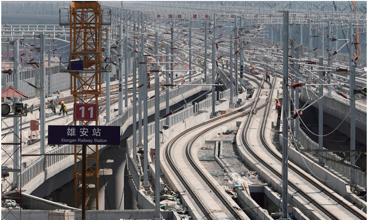
The construction site of the Beijing-Xiongan intercity railway in Xiongan New Area, Hebei Province in north China on July 24