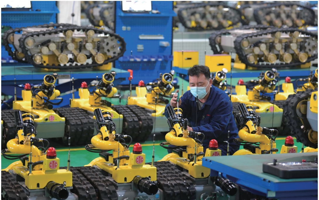
A robot workshop in the hi-tech industrial zone in Tangshan, Hebei Province in north China, on April 29