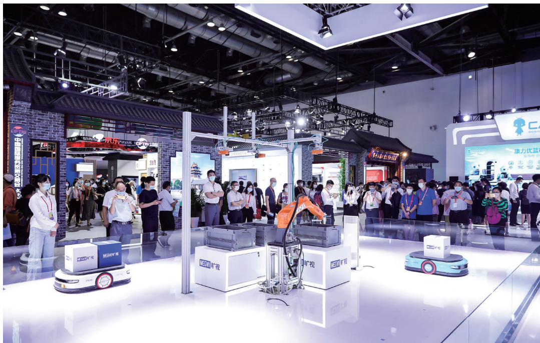
Robots and intelligent equipment for warehousing, logistics and manufacturing processes and supply chains developed by Megvii, an AI solution provider, are displayed at China International Fair for Trade in Services on September 6