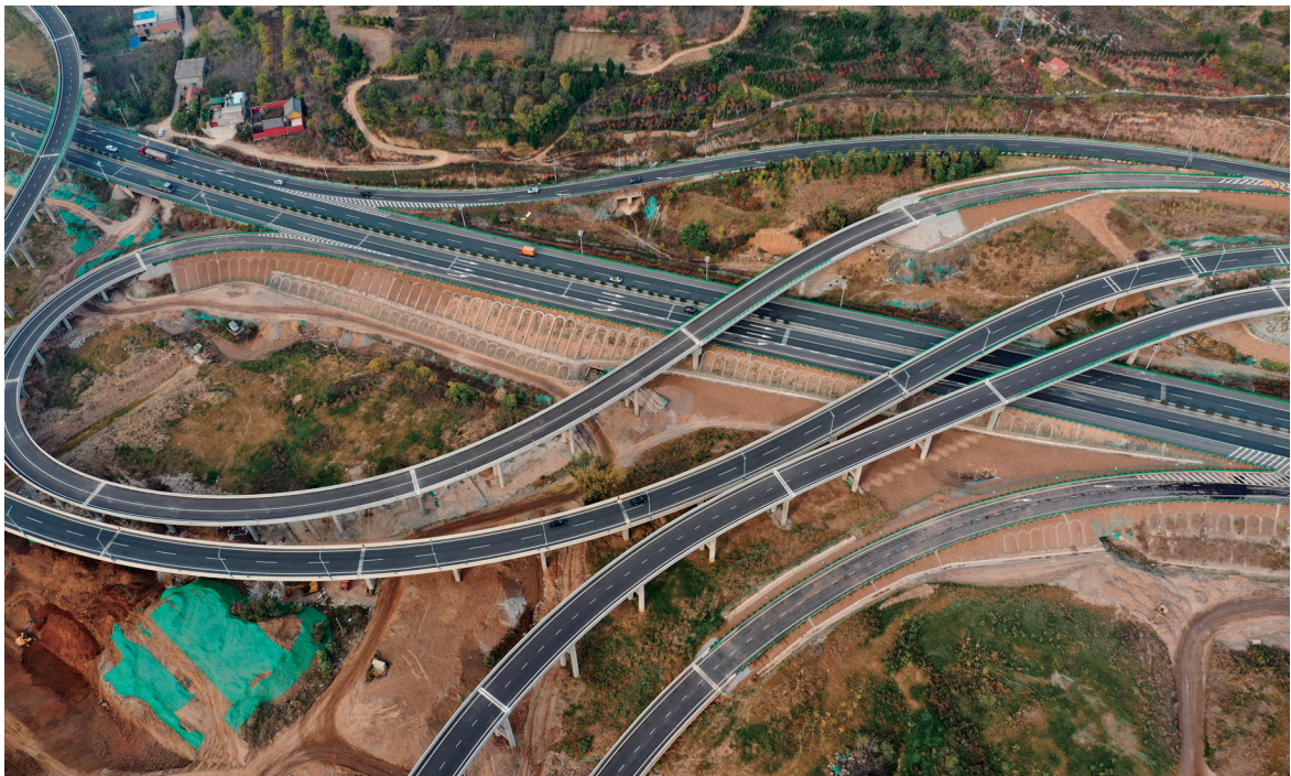
The Jinan-Tai'an Expressway in Shandong Province, east China, is put into operation on October 27. The 55.9-km expressway has shortened the travel time between the two cities to half an hour