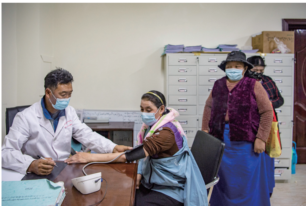
Villagers receive routine check-up at a rheumatism research base in the village of Caiqutang in Yangbajain Township, in Lhasa, Tibet Autonomous Region, southwest China, on August 27